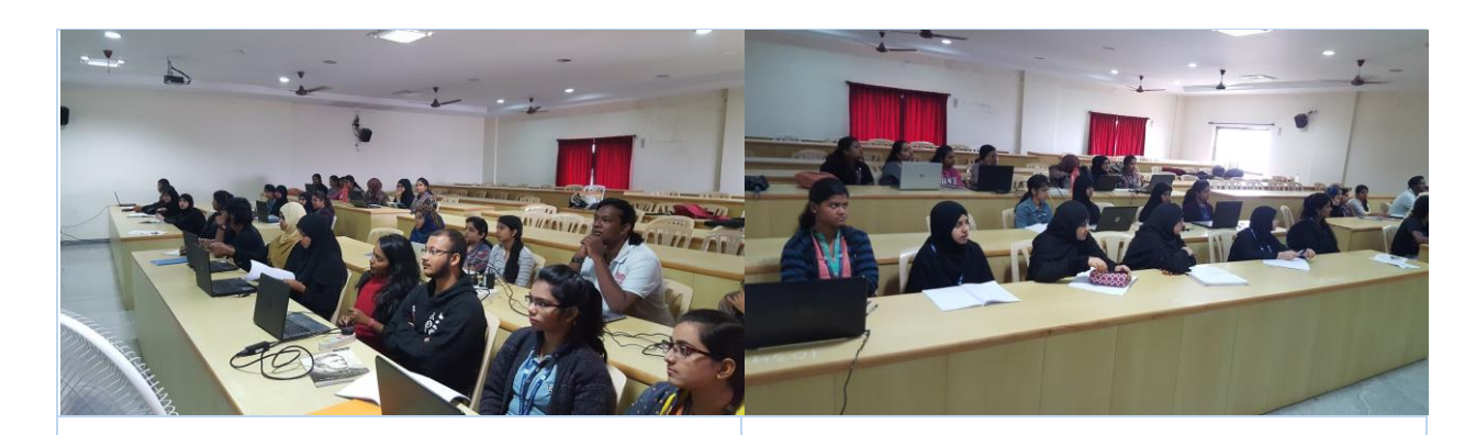
Glimpses of Students Participating in the SDP on "SQL" and having hands-on practice sessions